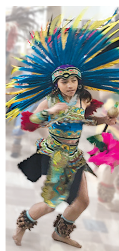
Danza Azteca Mixcoatl Anahuac