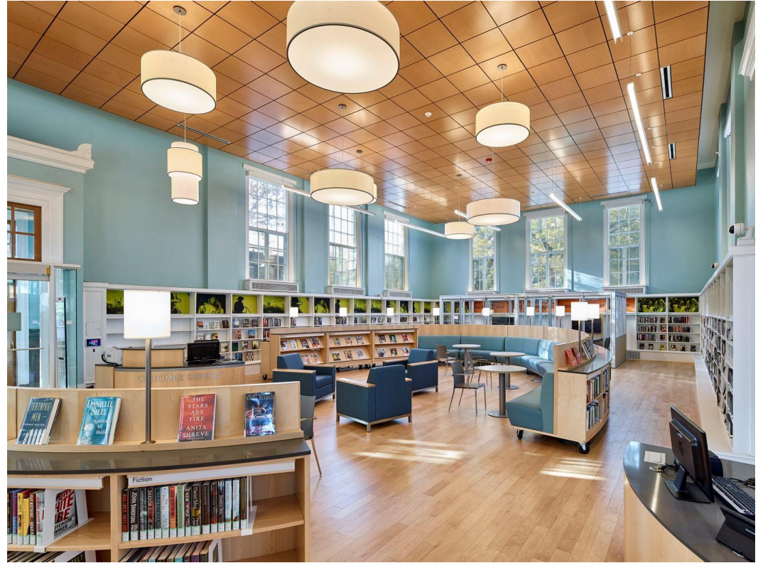
Logan Branch Library, Philadelphia Free Library