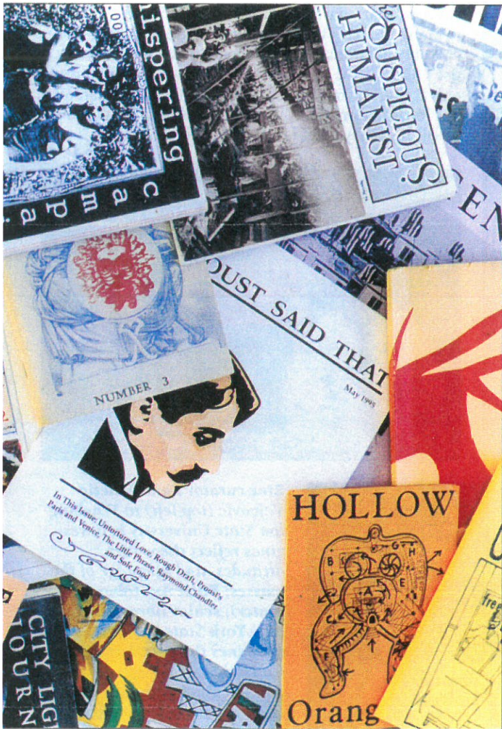
a sampling of the collection at San Francisco PL.