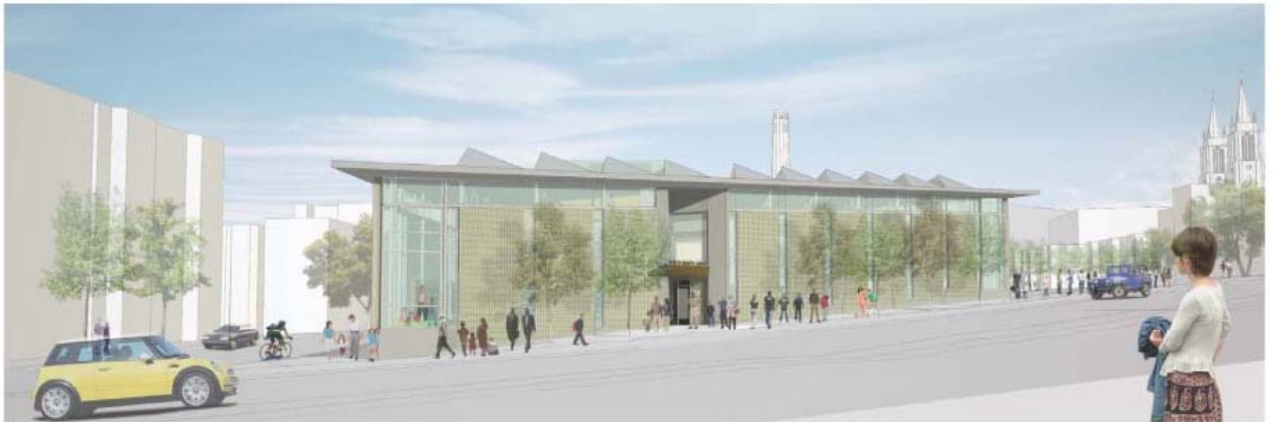
LIBRARY ALONG COLUMBUS AVENUE LOOKING EAST