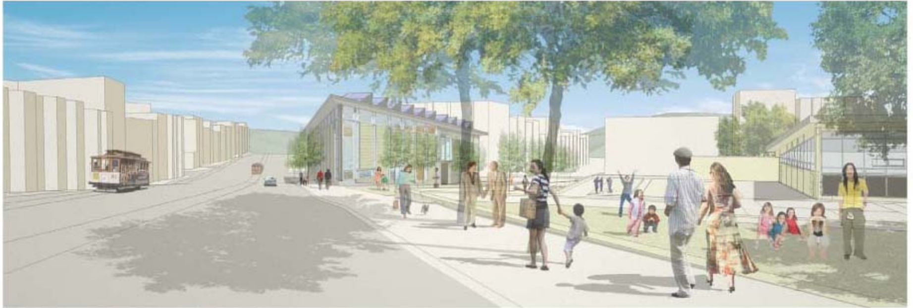
LIBRARY AND PARK FROM COLUMBUS AVENUE LOOKING NORTH